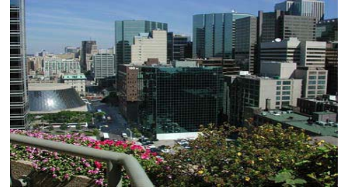
A view of beautiful Toronto, Ontario from the Intercontinental Hotel and Conference Centre where the 2004 Joint Statistical Meetings were held.