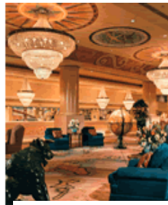
Lobby of the Hilton San Francisco.

In the effort to reach out more to our alumni, the Department has begun hosting Alumni Receptions coinciding with Statistical Conferences. Our first Alumni Reception, held in conjunction with the 2003 ENAR Conference in Florida, was a great success! Approximately 60 UM Biostatistics alumni, faculty, and